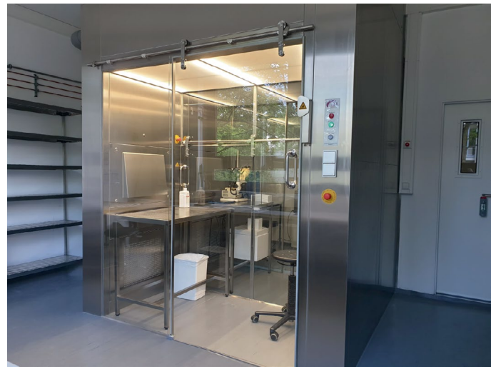
Fig. 3 | The Laminar Air Flow (LAF) cabinet. The LAF cabinet serves as a sterile intervention room for procedures involving Wildling mice and as an air lock to export samples from the Wildling area.

have designated rooms for breeding, housing and experimental procedures. Between the rooms of the respective areas, mice are transferred in closed individually ventilated cages (IVC). The cages can only be opened under class II work benches to ensure microbial containment and work safety. If the experiment includes both Wildling mice and SPF mice, mice in the SPF area must be handled first. The Wildling mice area is operated as a negative pressure higher safety level housing barrier with all the necessary personal hygiene and sanitation protocols normally foreseen in such areas.