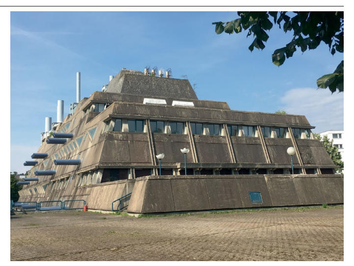
Fig. 1 | The "Mäusebunker" at Charité – Universitätsmedizin Berlin. First experiments with Wildling mice took place in the "Mäusebunker" ("mouse bunker") shortly before it was shut down in 2020. Today, the building is a listed monument as an outstanding example of brutalist architecture.

The conceptualization of a facility for Wildling mice at Charité – Universitätsmedizin Berlin started four years before it was eventually operational and the project was supported by concepts developed by