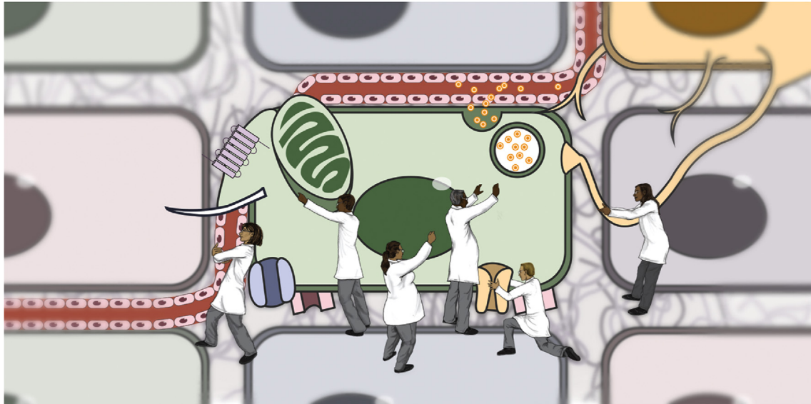
Figure 1: Efforts by islet scientists to define a \beta cell. The schematic shows individual scientists interacting with one of the key cellular processes of the \beta cell such as the nucleus, an ion channel, or a secretory granule. None of these individual processes provide a full understanding of what defines the \beta cell.

-Jainism and Buddhism. Udana 68–69: Parable of the Blind Men and the Elephant [1].