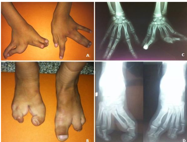
Figure 1: clinical (A, B) and radiological (C, D) features of SHFM phenotypes observed in patient II: 6