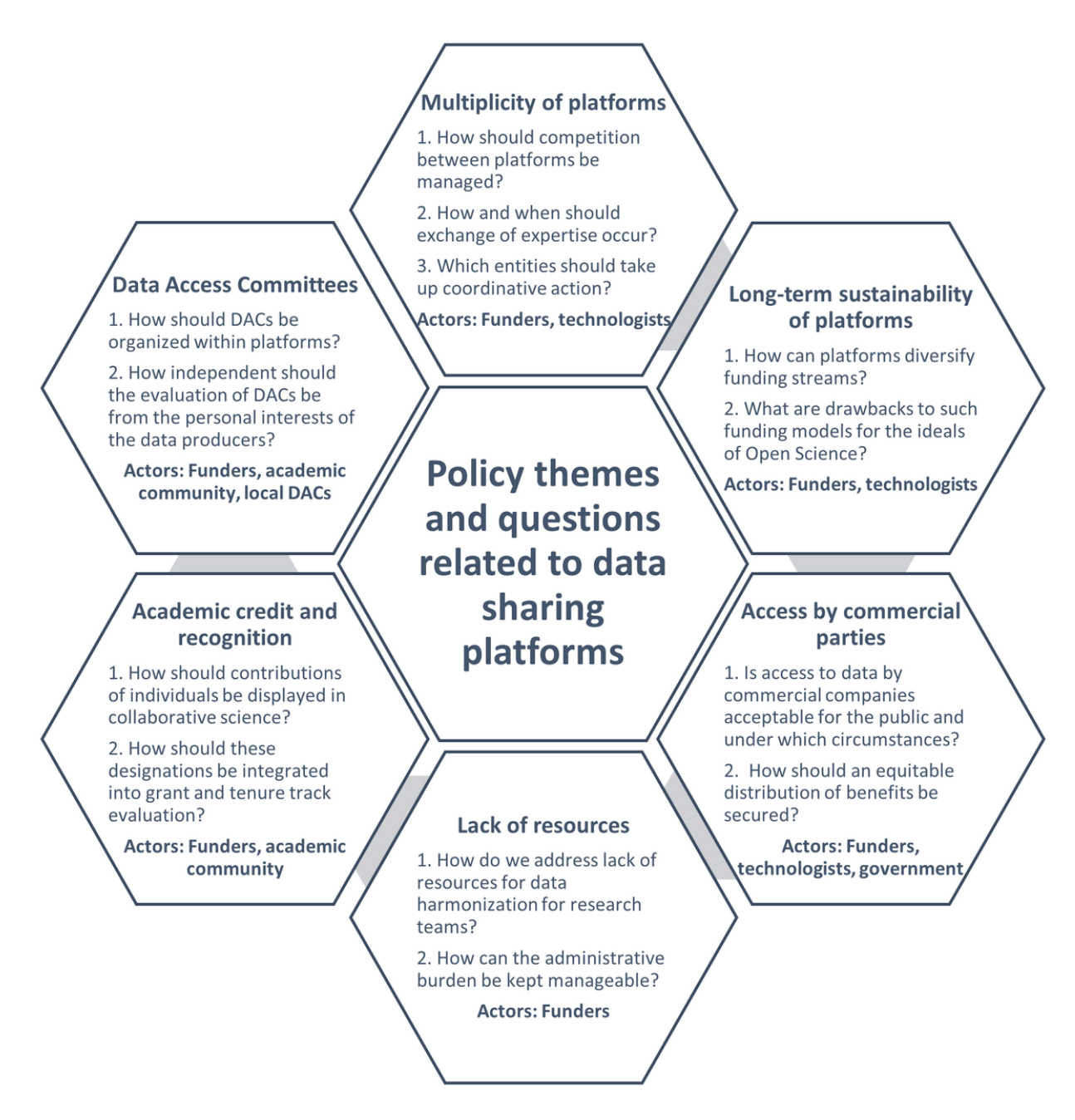
Figure 1. Key questions on each policy theme.

stantial policy divergence across institutes and countries, and limited direct funder intervention. Timely questions on the individual policy topics are outlined in Figure 1. The discussion addressed a range of subjects which were classified as follows: (1) multiplicity of platforms; (2) long-term sustainability of platforms; (3) lack of dedicated resources for data sharing; (4) access of commercial parties to medical data within platforms; (5) credit and recognition mechanisms in academia; and (6) the organization of data access committees within platforms.