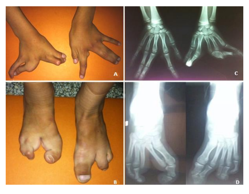
Figure 1 : clinical (A, B) and radiological (C, D) features of SHFM phenotypes observed in patient II: 6