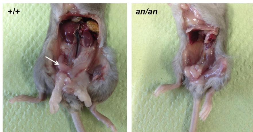
Figure S2. Genital phenotype in Cdk5rap2 mutant females. Uterus (white arrow) in the +/+ and ovaries are absent in an/an females.